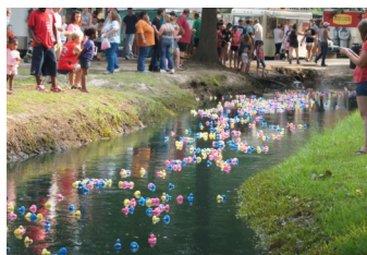
Ducks will go on sale May 1st