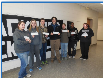
SHS Math Whizzes

Smackover high School recently competed in the Union county Math Competition. Students who placed and were awarded checks were (Left to right):