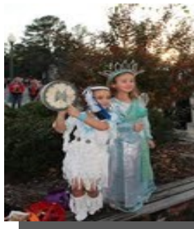
Trick or treaters enjoying the fun