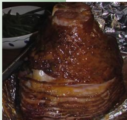
Apricot Brown Sugar Ham from allrecipes.com — perfect for Christmas dinner