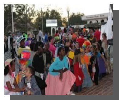
Costume contestants look on as other categories compete