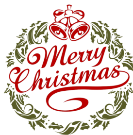
Downtown Christmas — December 5, 2015

shines above the downtown area of Smackover, and the